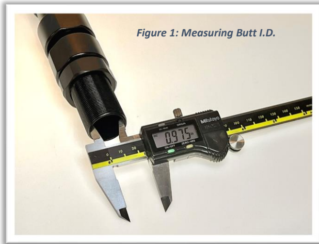
Figure 1: Measuring Butt I.D.

Find the ferrule that is glued to the base of your fishing rod and measure the O.D. as shown in figure 2. Then use the chart to determine the ferrule size.